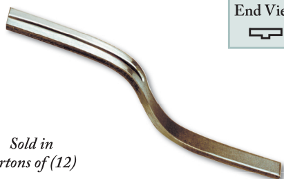
Sold in cartons of (12)