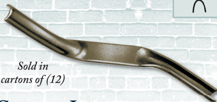
Sold in cartons of (12)