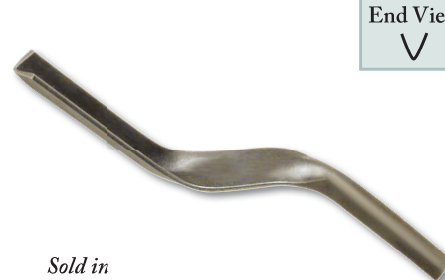
Sold in cartons of (12)