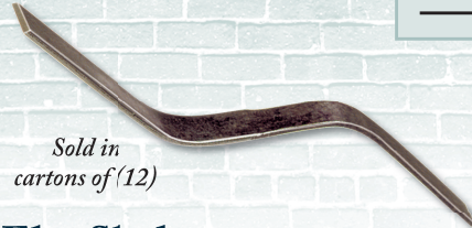
Sold in cartons of (12)