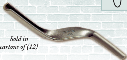
Sold in cartons of (12)