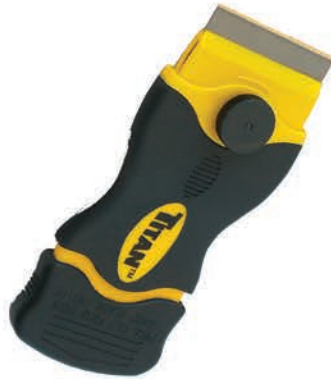
Composite Mini-Scraper P/N: MINISCRAP