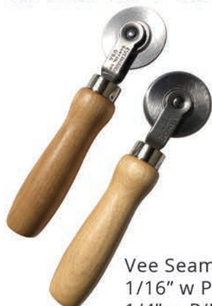
Vee Seam Rollers 1/16" w P/N: VEE16 1/4" w P/N: VEE4