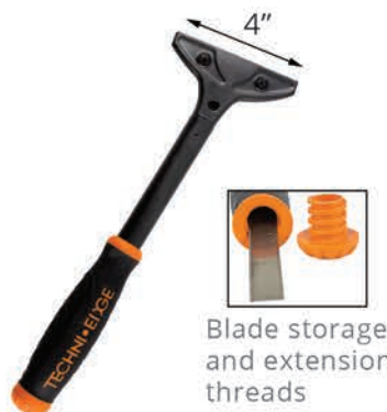
12" Scraper w/ blade storage and backend adapter for extension pole P/N: 4SCRAPDLX