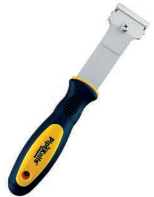
General Purpose Hand Scraper P/N: RBSHAND