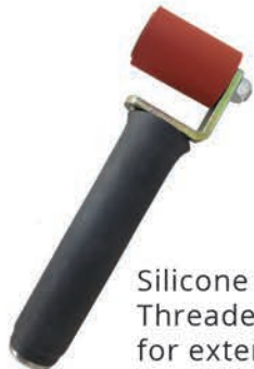
Silicone Roller w/ Threaded Handle for extension pole 2" x 2" P/N: GSR2THD