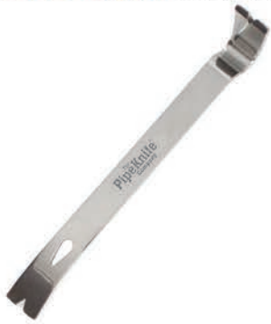
5-1/2" mini Pry Bar with claw P/N: MINIPRY