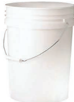
5 Gallon White bucket P/N: PAIL