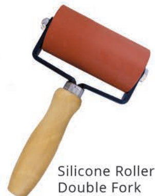
Silicone Roller Double Fork 2" x 4" P/N: GSR4