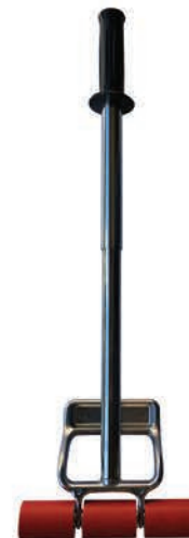
3-Section Silicone Roller with telescoping handle P/N: HANDROLL