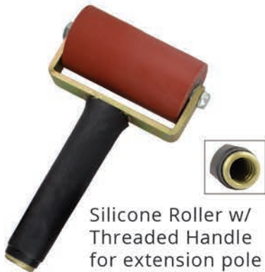
Silicone Roller w/ Threaded Handle for extension pole 2" x 4" P/N: GSR4THD