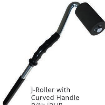
J-Roller with Curved Handle P/N: JRHP