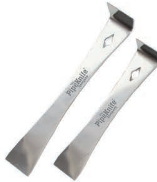
Combo 7" and 9" General Purpose Pry Bar Set in Blister Pack P/N: SPBDS