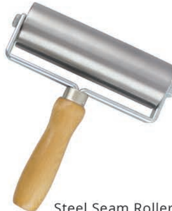
Steel Seam Roller Double Fork 2" x 6" P/N: GSRSTEEL6