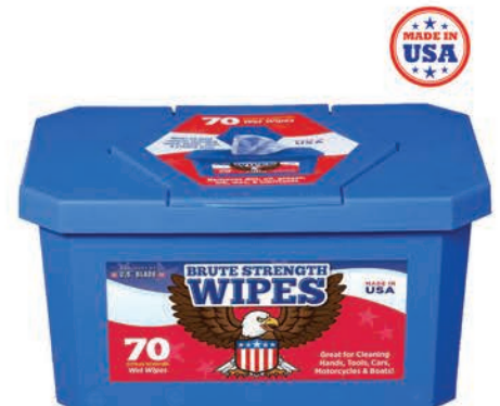
Wet Wipes P/N: WIPES