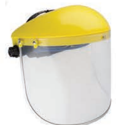
Protective Face Shield P/N: FACESHIELD