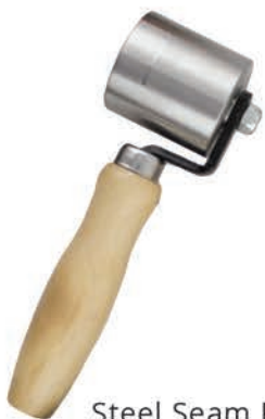
Steel Seam Roller Single Fork 2" x 2" P/N: GSRSTEEL2