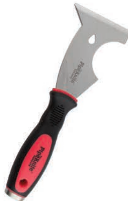
6IN1 Heavy-Duty Tool ( Best Seller ) P/N: 6IN1HD