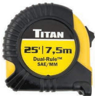
25' High quality tape measure P/N: 25TM