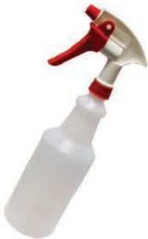
32 oz bottle with graduated markings and acid resistant heavy-duty nozzle P/N: SPRAYBTL