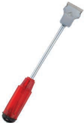
11.0" Long Reach Scraper P/N: LRSCRAPER