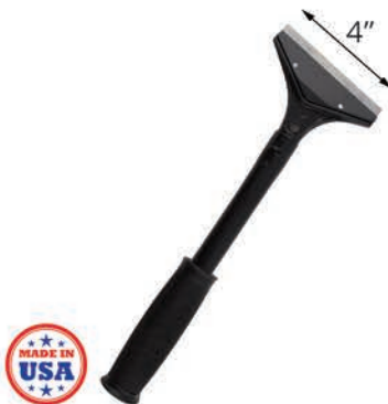
12" Long Scraper P/N 4SCRAP12, 18" Long Scraper (not shown) P/N: 4SCRAP18