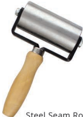
Steel Seam Roller Double Fork 2" x 4" P/N: GSRSTEEL4