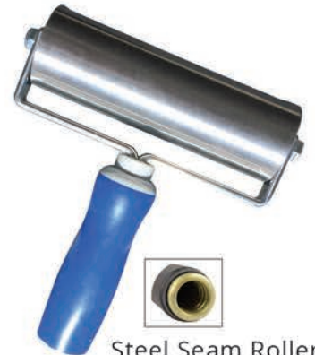
Steel Seam Roller Threaded 2" x 6" P/N: GSR6THD