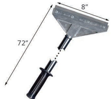
Super heavy-Duty scraper w/ telescoping handle - extends to 72" P/N: ADJSCRAPERHD