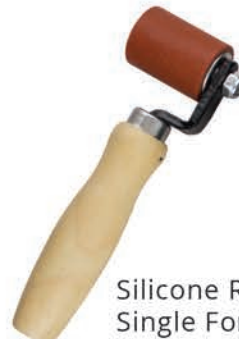
Silicone Roller Single Fork 1-5/16" x 1-3/4" P/N: GSR2