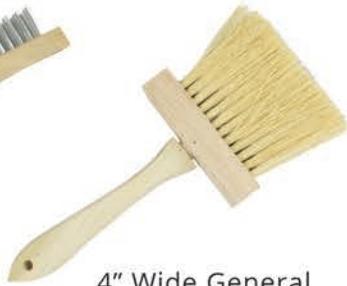
4" Wide General Purpose Masonry Brush P/N: 4MASBR