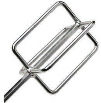
Egg Beater Mixer P/N: MXEB