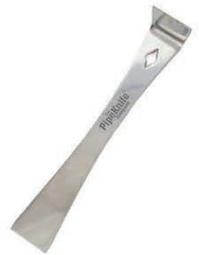
12" Long Heavy-Duty Glazing Tool P/N: XLPRYBAR