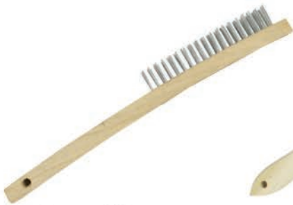
General Purpose Wire Brush P/N: WIREBR