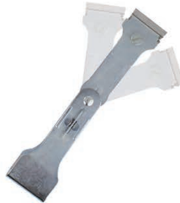
The deluxe 3-way scraper folds together to store blade P/N: RBSDXL