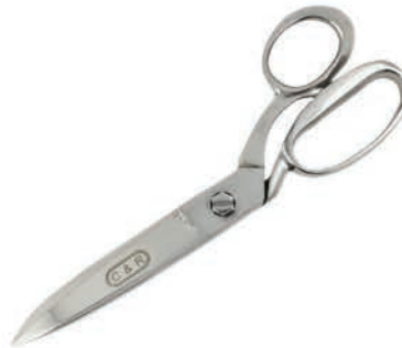
Heavy-duty Scissors/Snips P/N: SNIPS