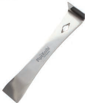
9" Heavy-Duty General Purpose Pry Bar and Glazing Tool P/N: MPRYBAR