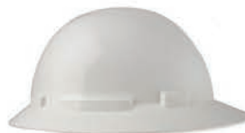
White Full Brim Safety Hard Hat with Ratchet Adjustment P/N: HHBRIMWHT