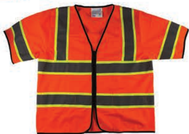
Premium Class 3 Safety Vest P/N: SVCCLASS3 Class 2 Safety Vest (Neon) not pictured P/N: SVCLASS2