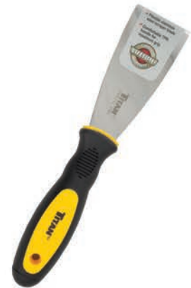
2" Putty Knife P/N: 2INPUTTY