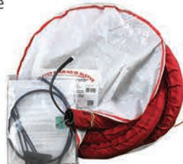
25' Heated Foam Hose Sleeve.

P/N: 0911HWE- 25' Heated Hose Wrap Extender Unit (combine up to 6 w/ starter unit)