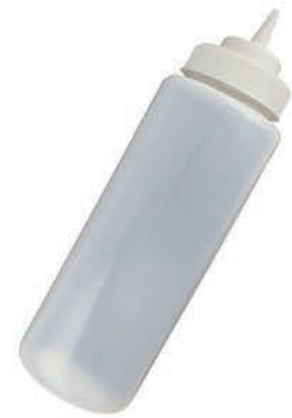
32 oz Squeeze Bottle to be used for self-leveling caulking application P/N: SQZBTL