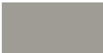
Limestone 273-P (LRV-43)