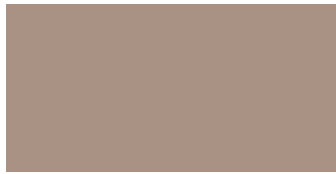
Quail Brown 203-M (LRV-29)