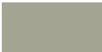
Precast Grey (Pigment pack not required)