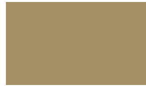
Brick Buff 99-T (LRV-45)